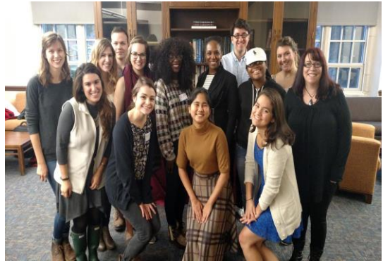
Students from WGS and allied groups, met with Bree Newsome before her talk.

The Center for Diversity and Inclusion, and other sponsoring programs welcomed Bree Newsome to campus on October 26 th . Newsome discussed the events that led up to her scaling the 30ft flagpole at the South Carolina statehouse to remove the Confederate flag following the funeral of Rev. Clementa Pinckney—one of 9 people slaughtered in the name of white supremacy at Mother Emmanuel Church. Newsome's intention was to create a new symbol and a new consciousness of the power inherent in direct action. The iconic picture of her on the pole with the flag in hand has become a touchstone of empowerment for disenfranchised people around the world.