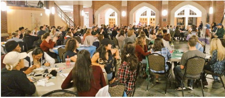
Students enjoying bingo in Dolan Atrium

The Drag Bingo phenomenon that started in Seattle in the 90s arrived at JCU on November 3 rd ! The WGS program helped provide educational materials for this event sponsored by Allies and Student Union. Over 200 students attended and had a fun-filled night learning about inclusivity and the LGBTQ community.