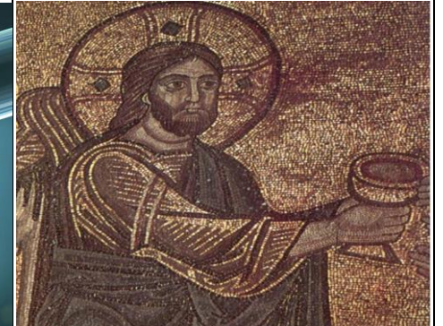
Christ with Medicine of Immortality