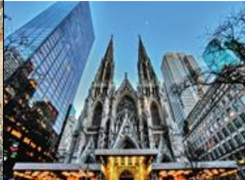
St. Patrick's Cathedral, New York City