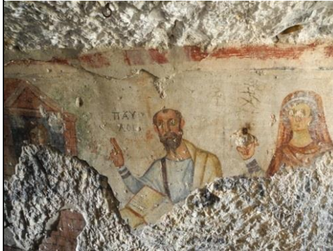
Fresco of Paul & Thecla (6th c.) Ephesus