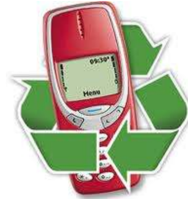
-- Cell phones