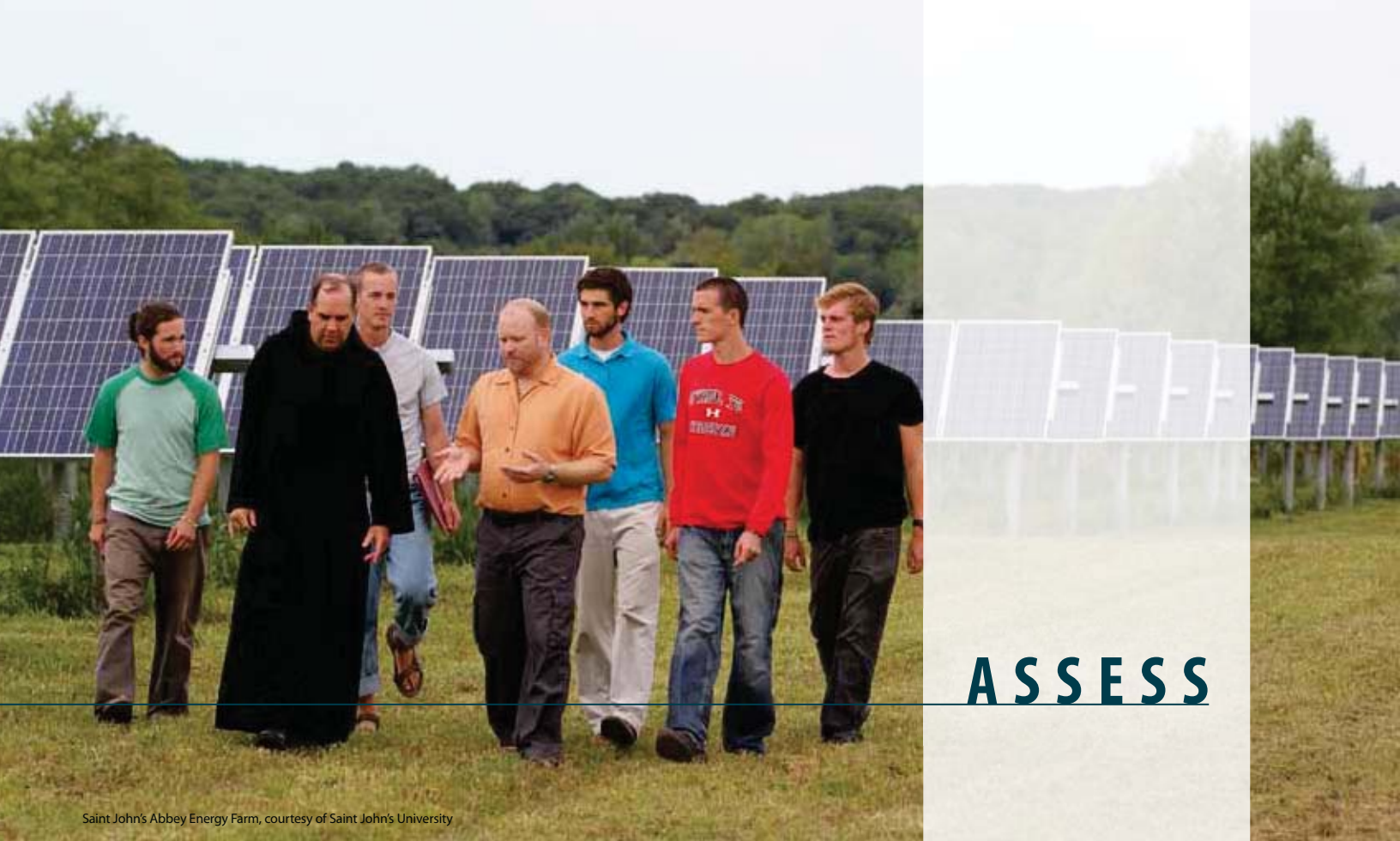
Saint John's Abbey Energy Farm

“Modern society will find no solution to the ecological problem unless it takes a serious look at its life style. ” (emphasis in original)