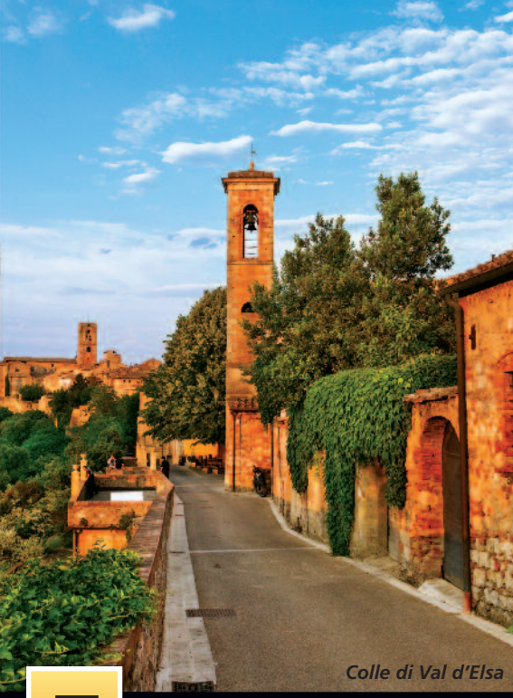
Colle di Val d'Elsa