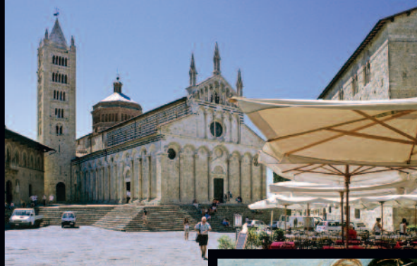
Top to bottom: Massa Marittima Detail of "The Birth of Venus," Botticelli Tuscan specialties