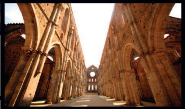
Above left: Cathedral, Siena | Top: San Gimignano | Above: The ruins of the Abbey of San Galgano