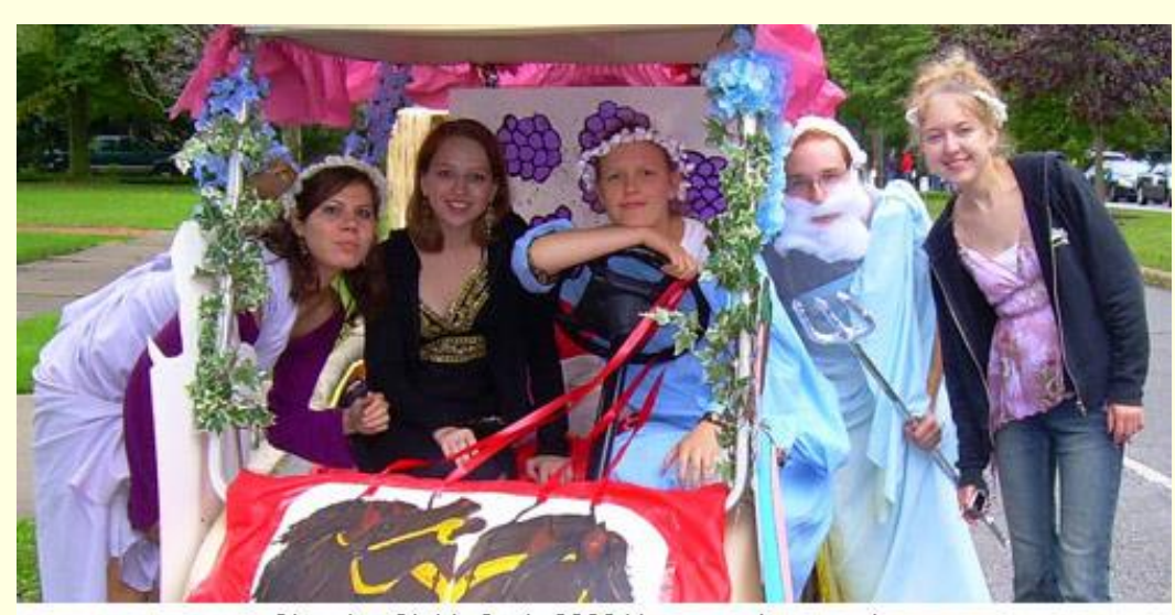
Classics Club's float, 2006 Homecoming parade