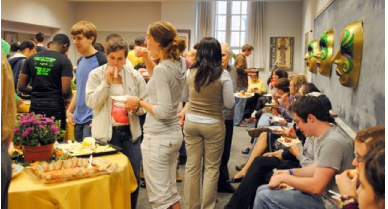
Students, faculty & staff mingle at the reception.