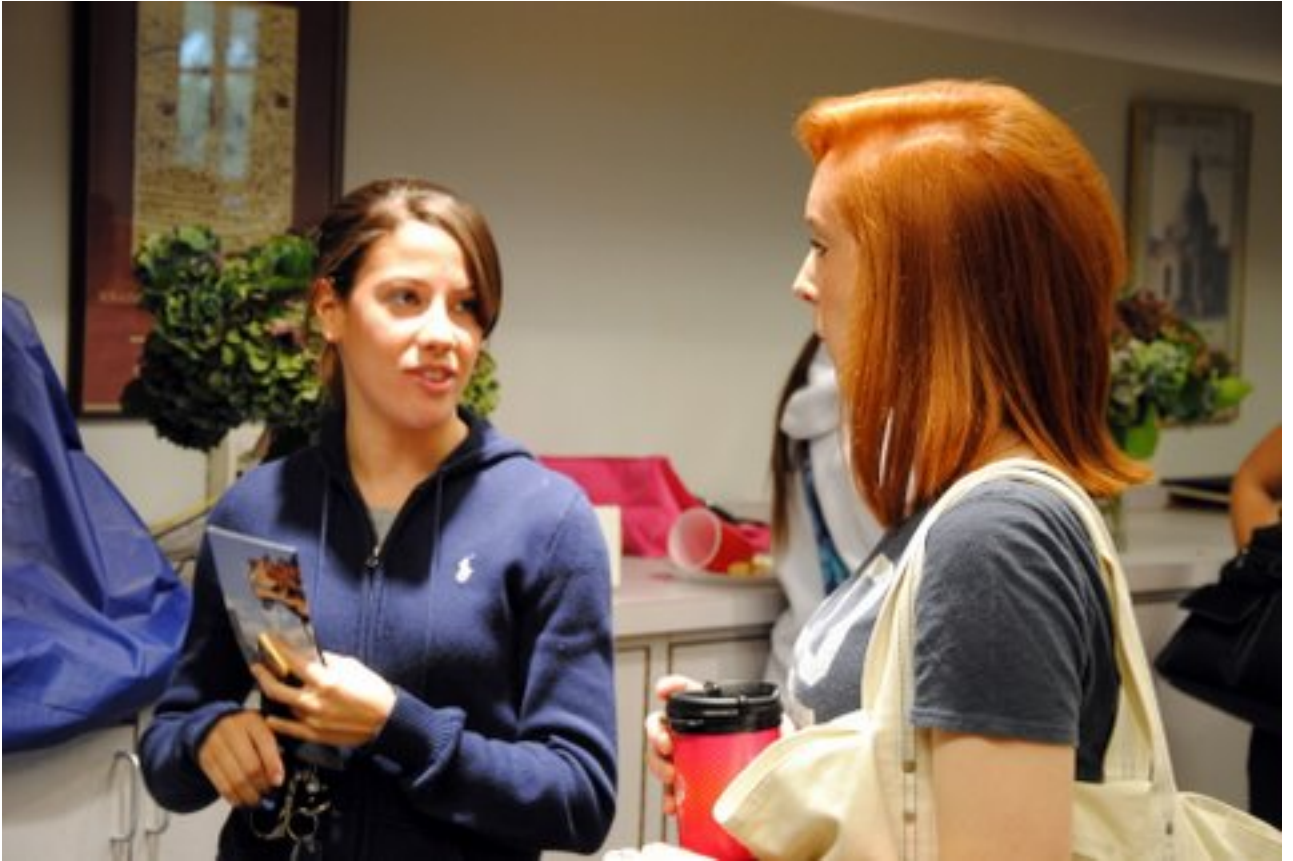
Two student guests.