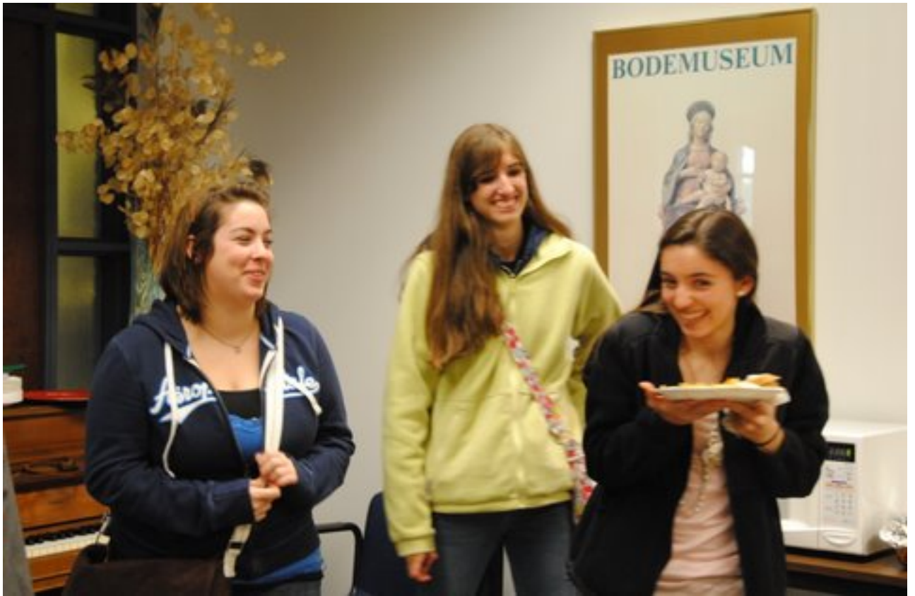
Students enjoy the reception.