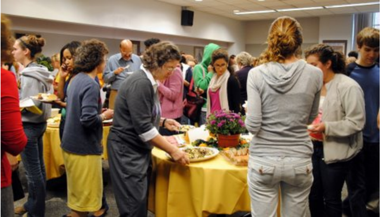
Great international foods.