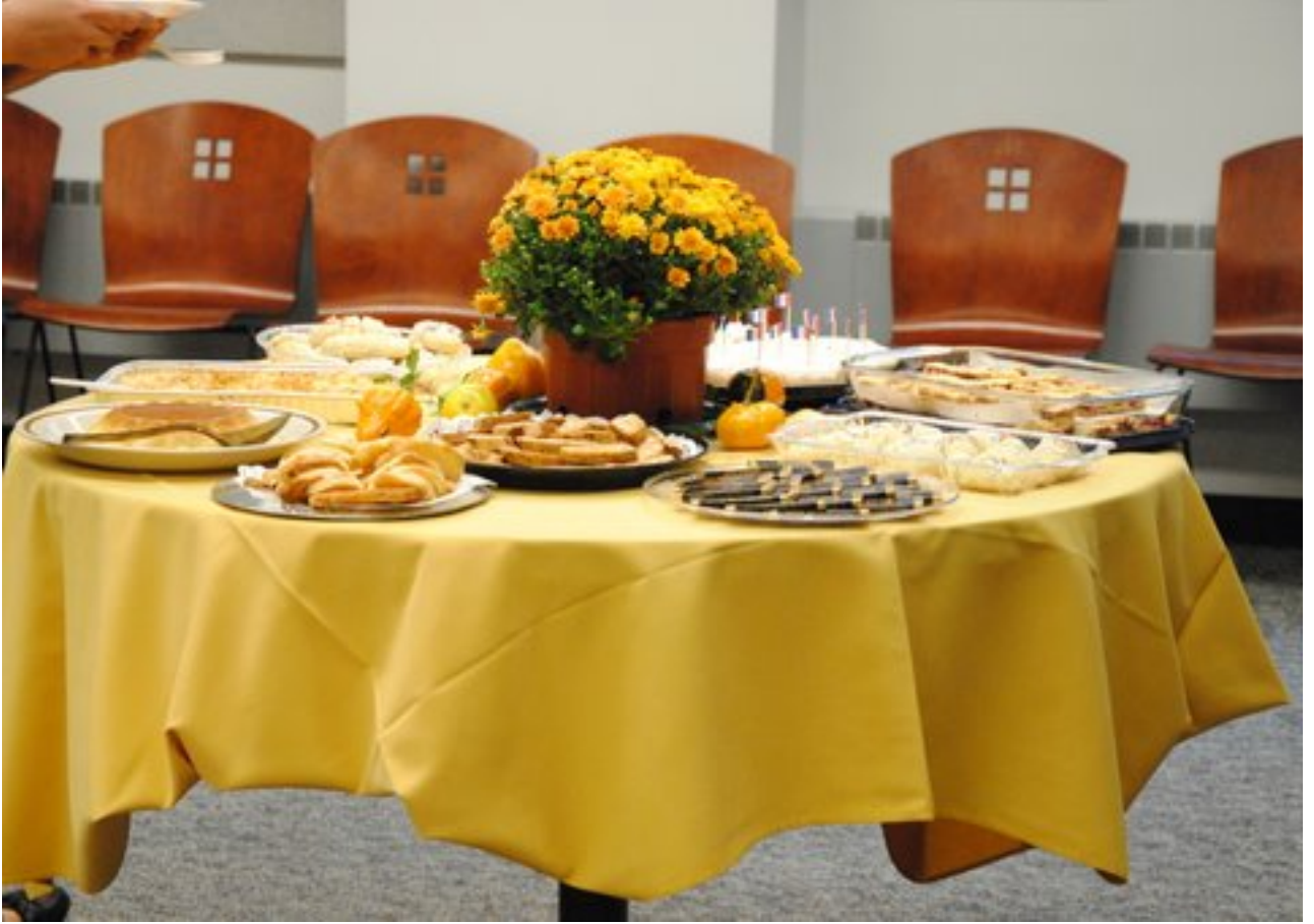
The international desserts table!