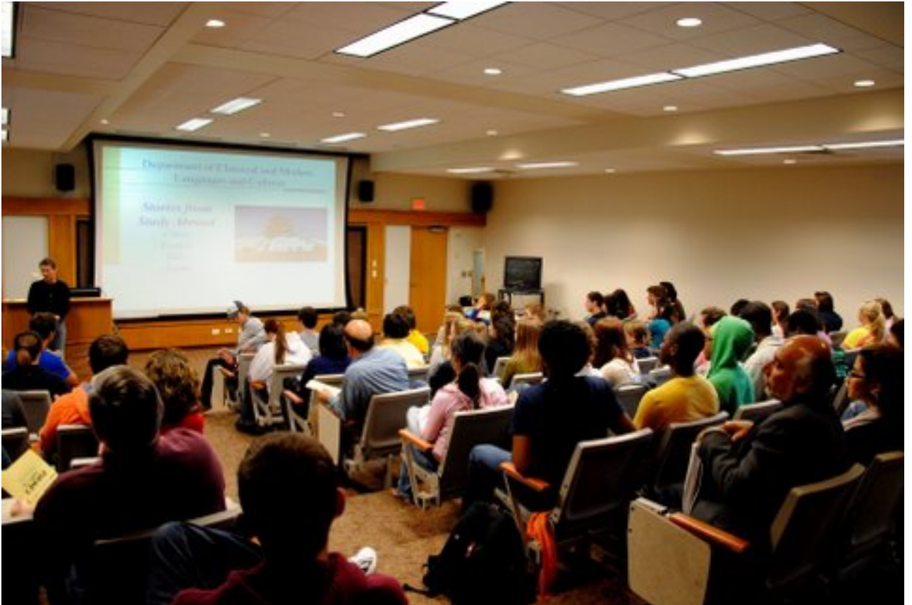
Part of the audience for the CMLC "Meet Your Major/Minor/Concentration" Program.