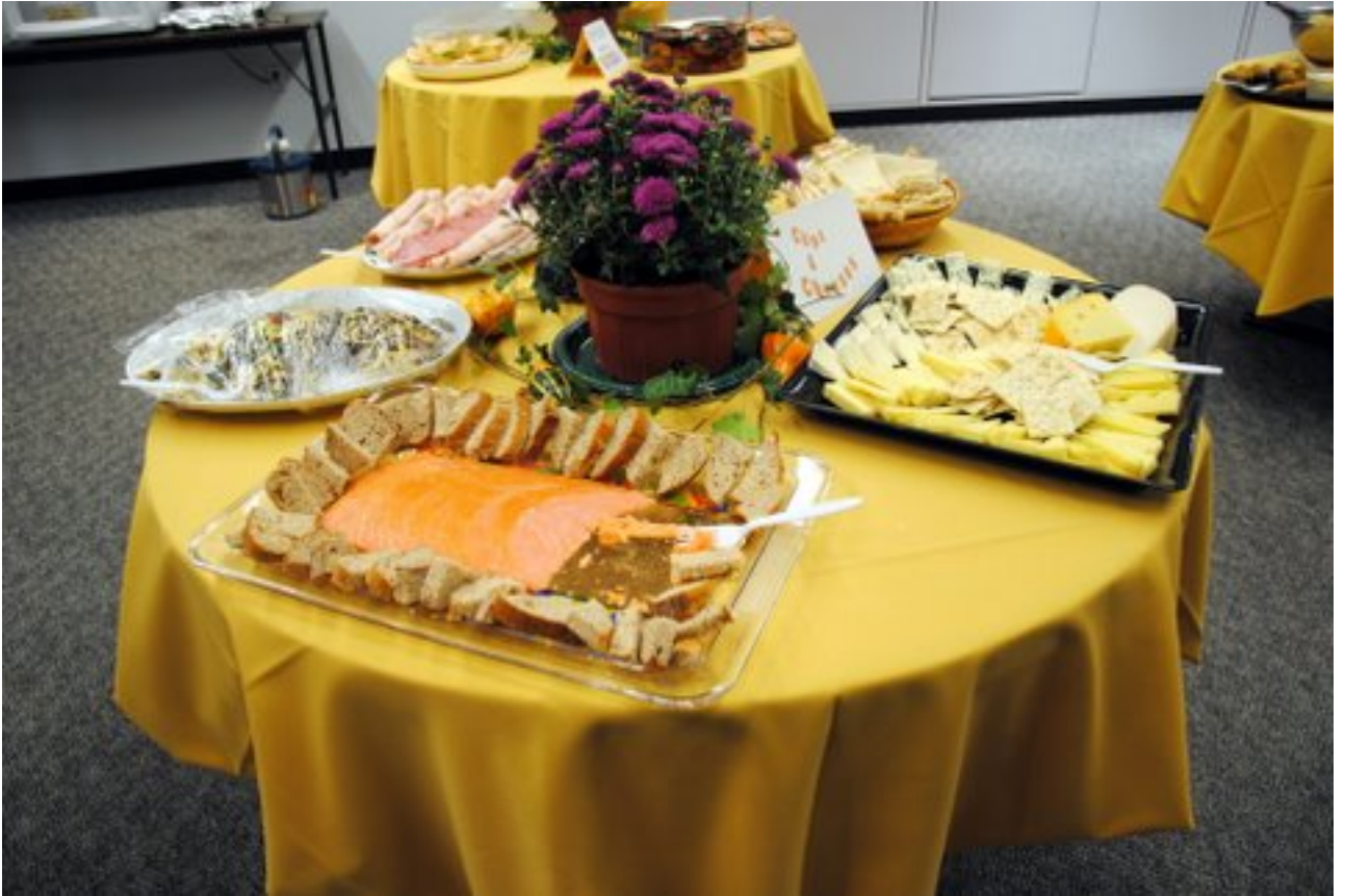
More great foods of the world!