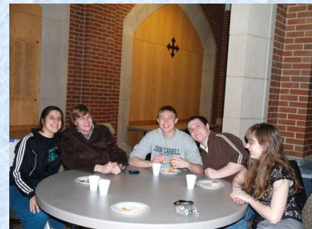
Above : Mardi Gras activities