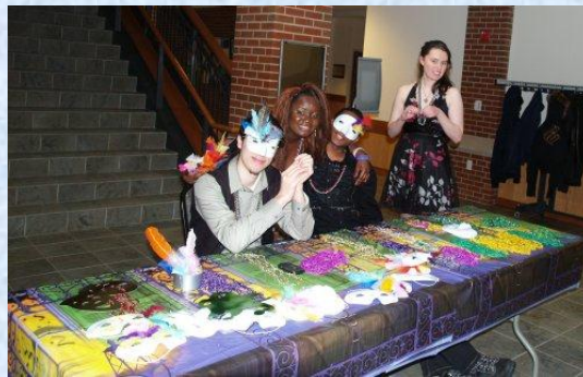
Above: Above: Mardi Gras mask-making