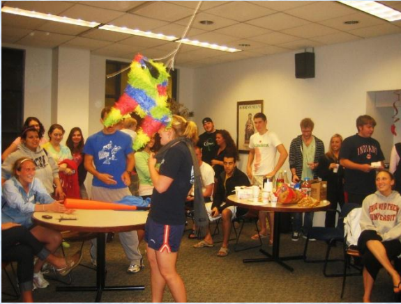
BELOW: "Tertulia 2010" photos: