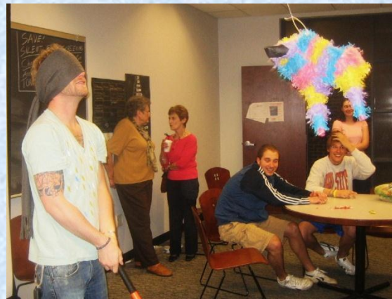
ABOVE: "Tertulia 2010" photos: