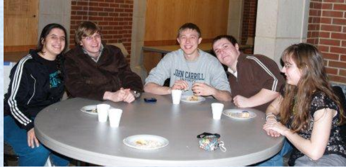
Above: A few of the Mardi Gras guests