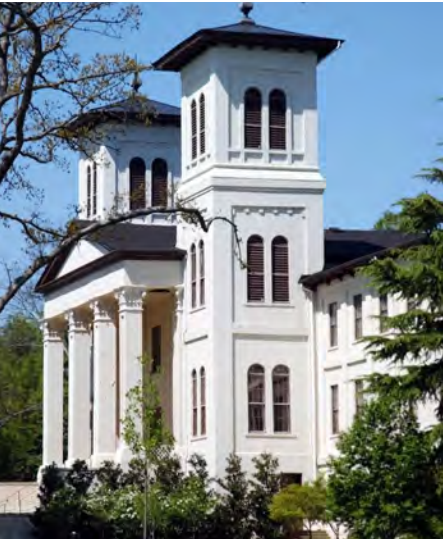
Established in 1854, Wofford College is an independent, Phi Beta Kappa liberal arts college of 1,600 students. Located in Spartanburg, South Carolina, Wofford is affiliated with the United Methodist Church. www.wofford.edu

Almost 300 DQP projects are underway now across the country, suggesting that the DQP has the potential to make a powerful impact on American higher education. The pioneering work of the CIC/DQP Consortium contributed significantly to an understanding of the potential of the Degree Qualifications Profile to improve student learning and to the ability of higher education to demonstrate that learning achievement to itself and to the world.