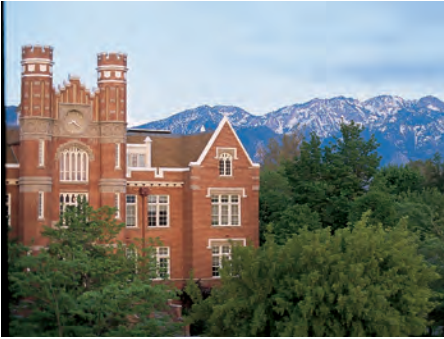
Westminster College (Utah) is a comprehensive liberal arts college with 38 undergraduate majors and 14 graduate programs. Founded in 1875, the college currently enrolls 3,100 students (2,300 undergraduates and 800 graduate students). www.westminstercollege.edu