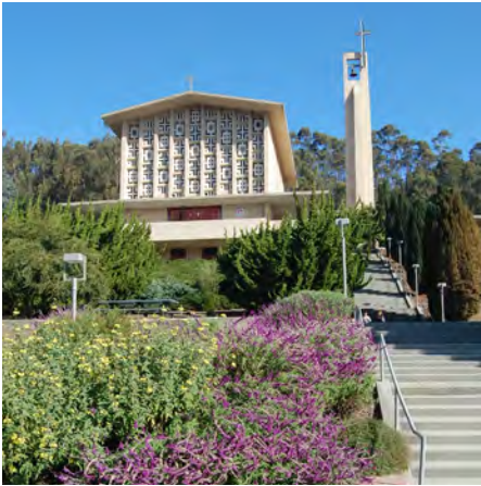
Holy Names University (California) is located in the Oakland Hills. Founded by the Sisters of the Holy Names of Jesus and Mary in 1868, the university offers 19 bachelor's degrees, five degree completion programs for adults, seven master's degrees, and various certificates and credentials. www.hnu.edu