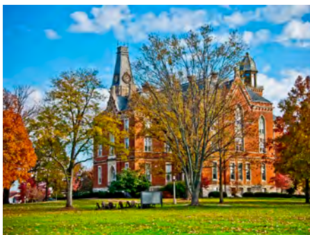
Founded in 1837, DePauw University (Indiana) is home to one of the nation's first schools of music. Today the university serves 2,300 students from across the country and around the globe. www.dapauw.edu

The DQP project at Davis & Elkins College sought to develop a first-year seminar to include a three-week winter term symposium for first-year students focusing on a current issue, to develop a college-wide senior capstone requirement, to review and reform general education, and to measure the contribution of the co-curriculum to student learning. The team recognized that these goals were broad and ambitious, but team members believed that making progress on all of these goals at the same time was necessary for the coherence of the academic program, particularly given substantial changes in academic affairs in the past several years. The college has made significant progress toward realizing all project goals and, having achieved success with the co-curriculum, is now focused on general education.