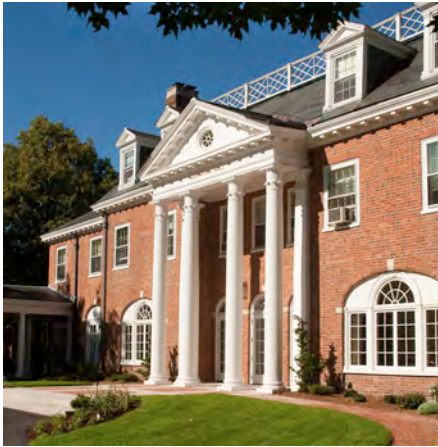
Bay Path College (Massachusetts) is a four-year private college with an enrollment of more than 2,300 students at its Longmeadow campus and satellite campuses in Sturbridge and Burlington. Founded in 1897, the college offers undergraduate degrees for women and graduate degrees for men and women. www.baypath.edu